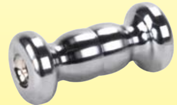
5 lb. Hammer in Polished Chrome Finish.

No. 4579 – 9-Way slide hammer set. Wt., 17 lbs., 7 oz.