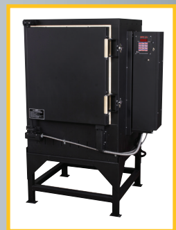
5281 Thermal Processing Unit