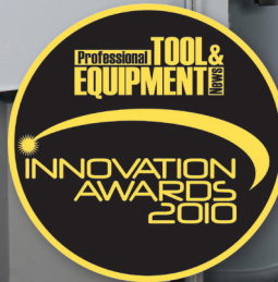
5280 DPF Cleaner