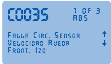
ABS Code Screen in Spanish