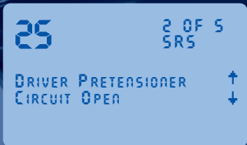
Airbag (SRS) Code Screen