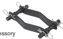
No. 6583 Bridge Accessory