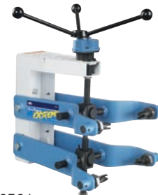
No. 6591 StrutTamer Extreme Height 29" (736 mm) Width 21" (533 mm) Depth 20" (508 mm)