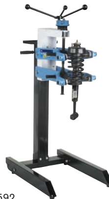
No. 6592 StrutTamer Extreme with stand Height 54" (1372 mm) (36" without handle) Width 22-1/2" (572 mm) Depth 32" (813 mm)