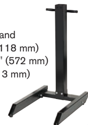
No. 6582 StrutTamer Stand Height 44" (1118 mm) Width 22-1/2" (572 mm) Depth 32" (813 mm)

12-138 ©2012 OTC. All rights reserved. Because of ongoing product improvements, we reserve the right to change design, materials, and specifications without notice. Certain kits may require additional cables or adapters. Product shipped may differ from photo(s) shown.