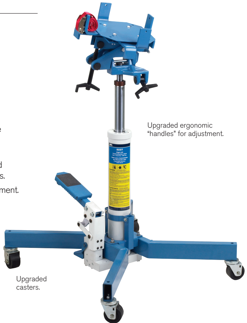
Upgraded ergonomic "handles" for adjustment.