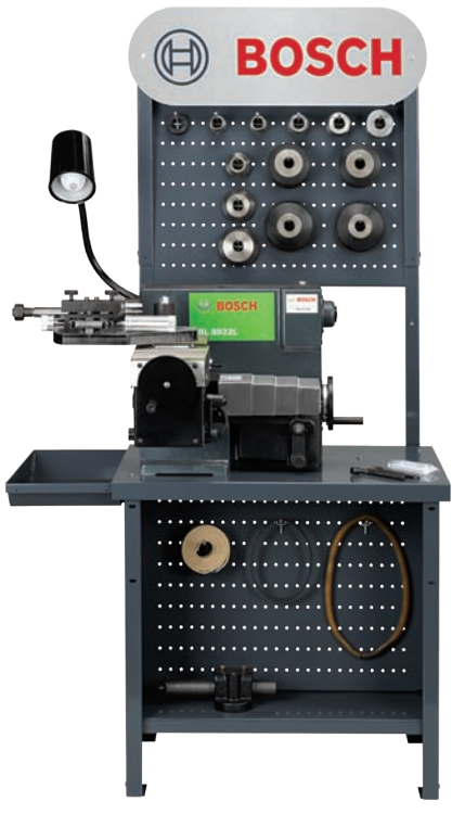
BL 8991 = BL 8922L Lathe + Bench + Accessories

High Performance Multi-Speed Combination Machining Center (F00E900233)