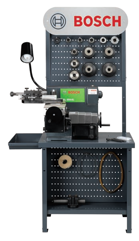
BL 8993 = BL 8944L Lathe + Bench + Accessories