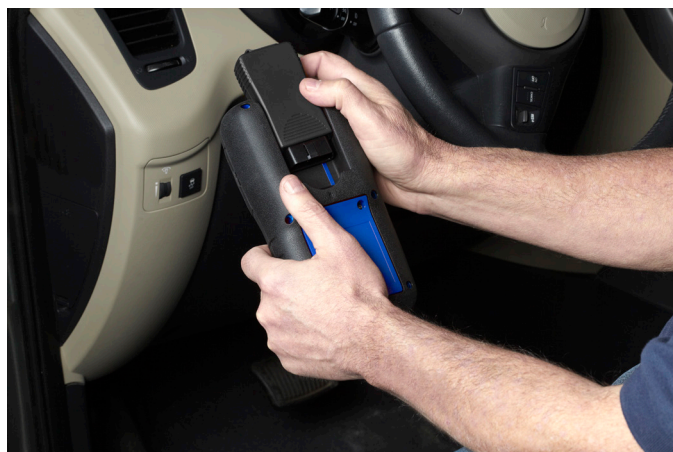
Dock the OBD-II Adapter on the back of the Handset