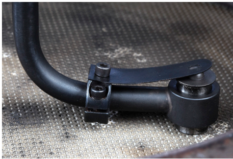
Curved neck nozzle with floating puck for angled-flange DPFs.