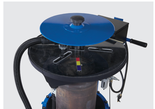
Includes innovative shield to protect cleaning area from moisture.