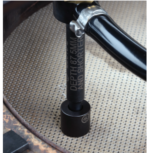
Long nozzle with floating puck for standard open face DPFs.