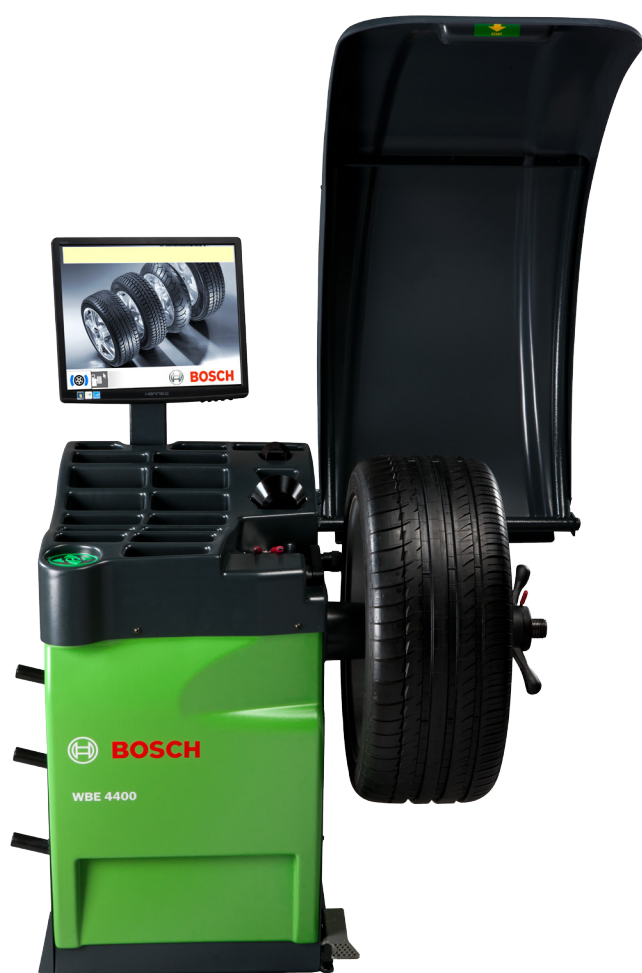
1694100287810 WBE 4400 Video Wheel Balancer