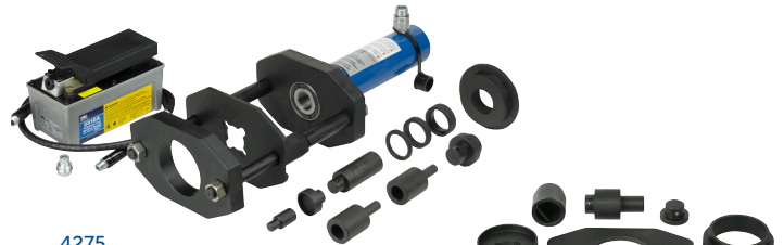
4275 4274 (Same as 4275 without 2510A air/hydraulic pump)