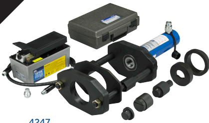
4247 4246 (Same as 4247 without 2510A air/hydraulic pump)