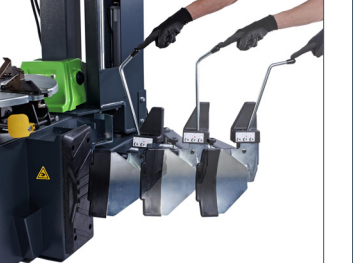
Ergonomic Controlled Bead Breaker maximizes operator control and comfort.