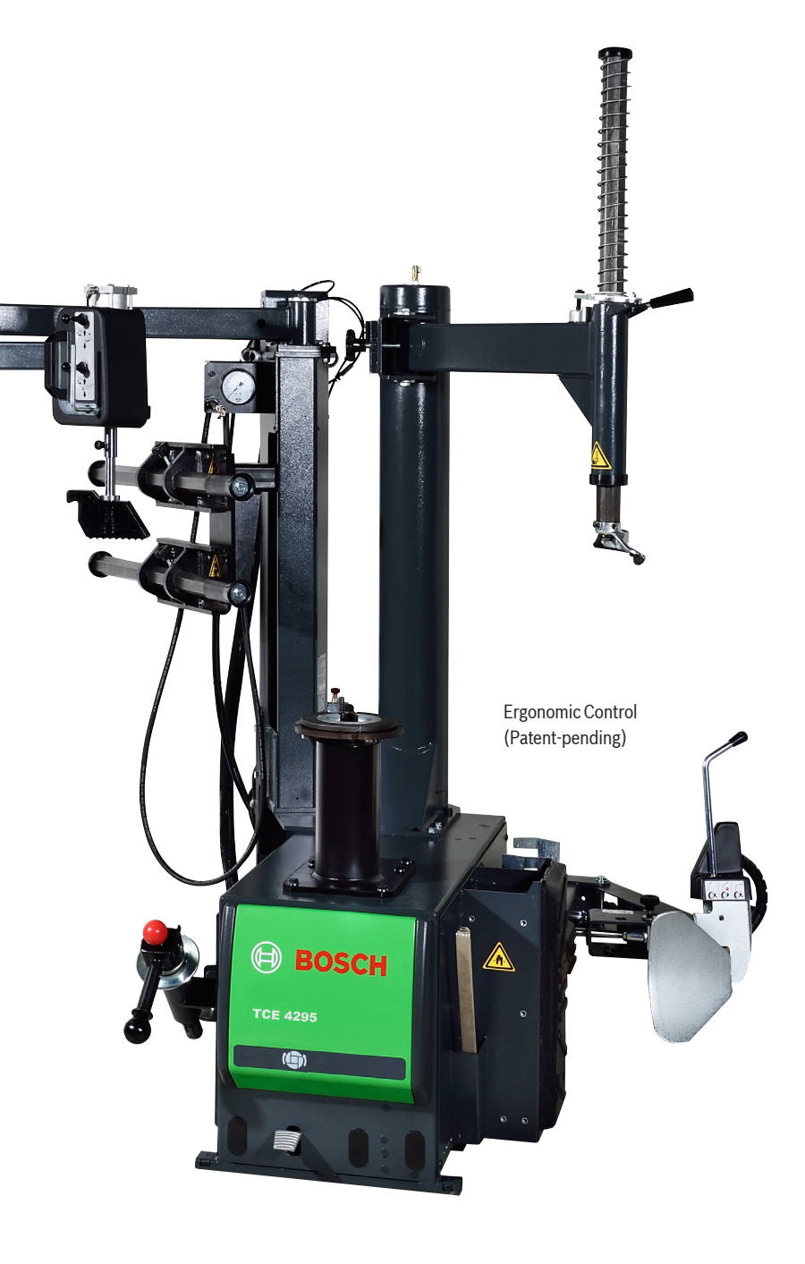
Controlled Bead Breaker maximizes operator control and comfort.

Easy to use Smart Lock center locking system quickly secures wheel