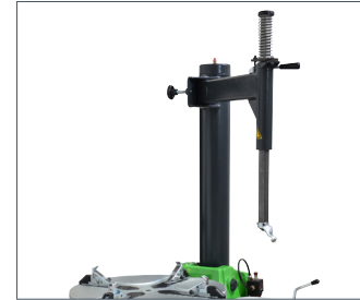
Model TCE4275E shown