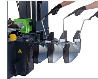
Bead press device and roller provide optimal control while mounting challenging beads