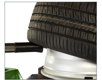
Unique bead roller gently lefts and removes bead beads