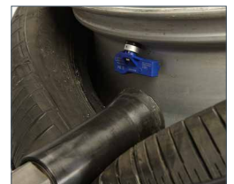
The multi functional bead roller assist the operator with TPMS service.