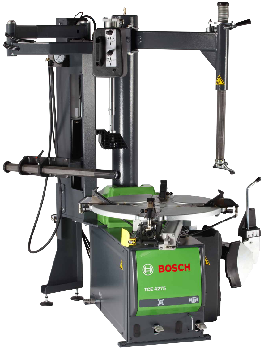
Model TCE4275EHC shown