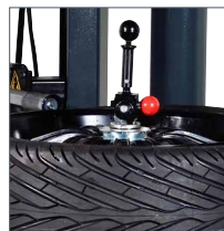
Easy to use Smart Lock center locking system quickly secures wheel.