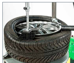
Bead press device and roller provide optimal control while mounting challenging beads.