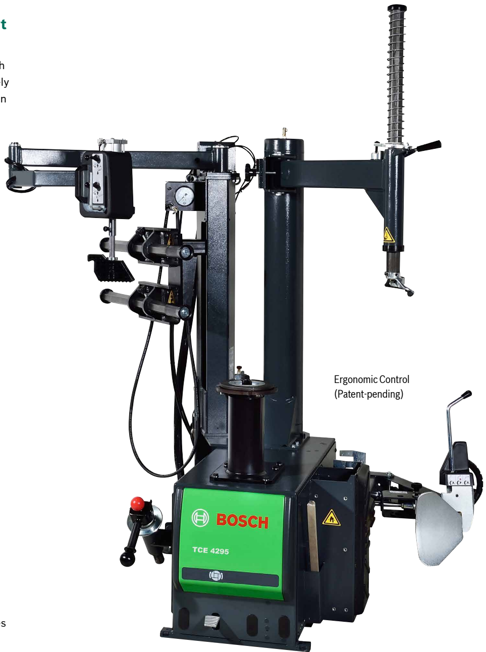
Ergonomic Control (Patent-pending)