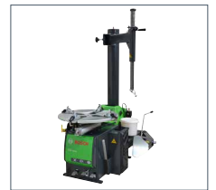
Model TCE4275E is available without Helper Assembly (shown).