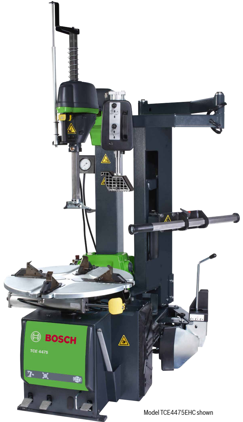
Model TCE4475EHC shown