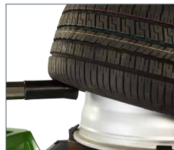
Unique bead roller gently lefts and removes bottom beads