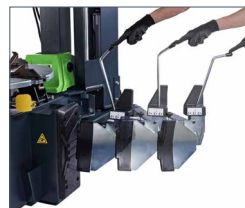
Ergonomic Controlled Bead Breaker provides the operator ultimate control and comfort.