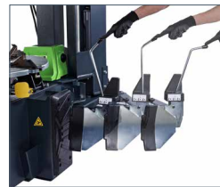
Optional Ergonomic Controlled Bead Breaker maximizes operator control and comfort.