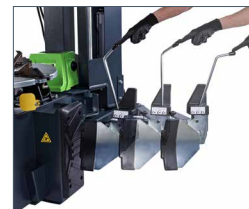
Controlled Bead Breaker maximizes operator control and comfort.