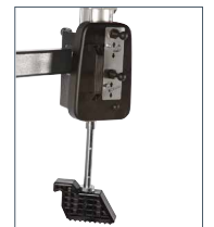
Articulating bead press device and dual-height bead rollers operate independently yielding precise control.