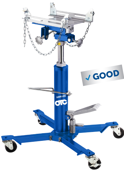
TJH10 1,000-lb capacity high-lift transmission jacks

ASME PASE-2019 tested with limited lifetime warranty