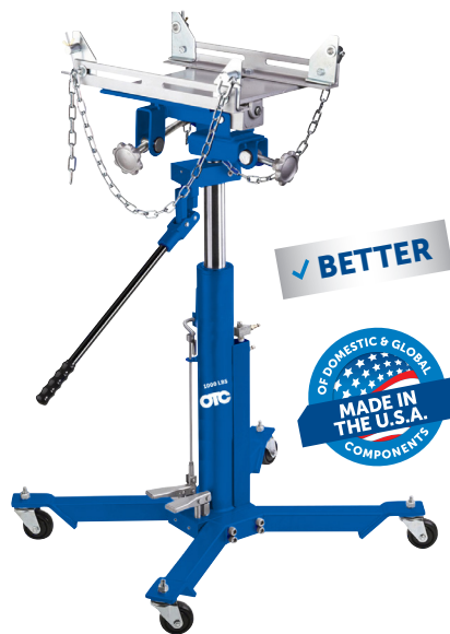
TJHP10 Air/hydraulic 1,000-lb capacity high-lift transmission jack