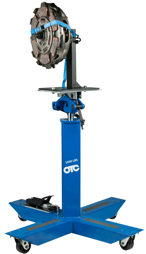
1797 adapter shown on TJHP15; jack not included