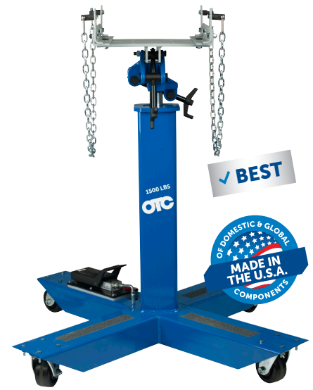
TJHP15 Air-assisted 1,500-lb capacity high-lift transmission jack