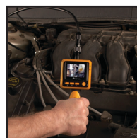
View brake/engine systems