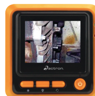
2.4" color LCD screen