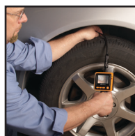
3ft. flexible camera tube